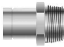
Male Adapter UMA